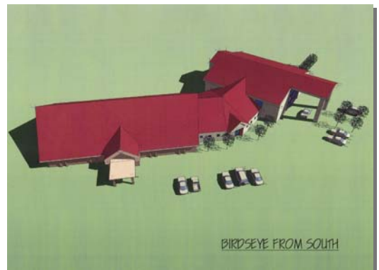
Slide – 2 Birdseye View from the South