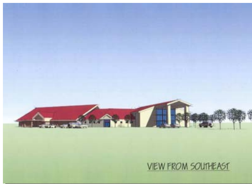
Slide – 3 Ground level from the South