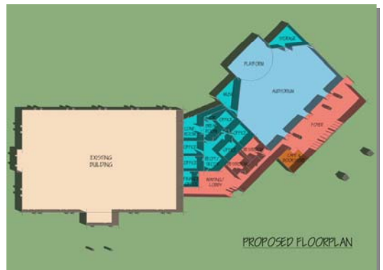
Slide – 4 3D Floor Plan