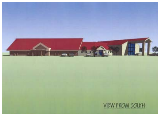
Slide – 1 View from the South

We are placing these before you, not for detailed study, but to show our present progress. As we present our timeline and our challenges, we want you to see what has engaged us and enthused us.